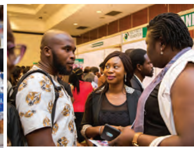
...network with fellow professionals