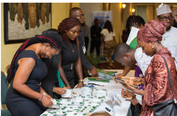
FHC 2018 was an avenue for many to...

There is a need to review the Nigerian Medical Association fee payment policy.