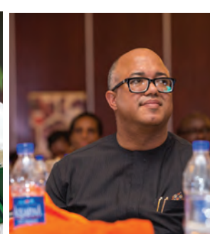
...and engage on many levels...