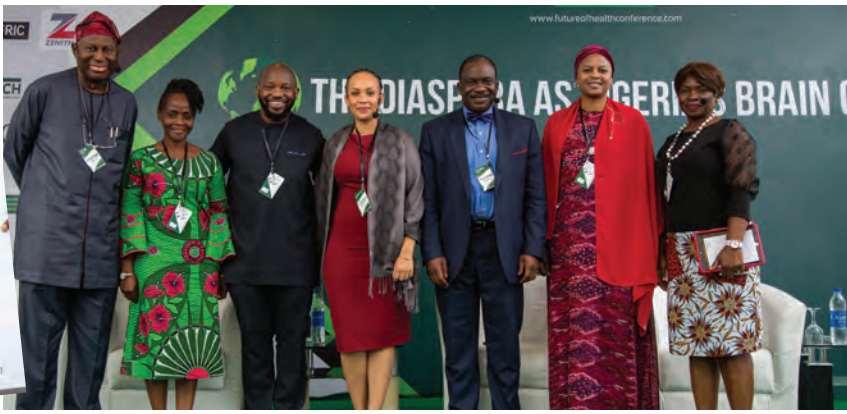
...share group photographs