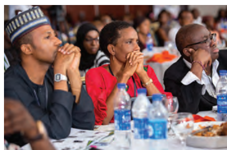
...listen to current topical trends