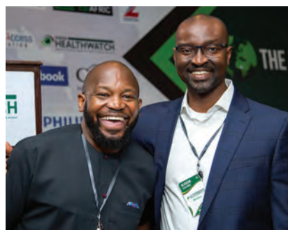
... meet friends